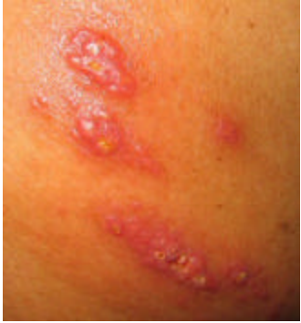
Lesions on back