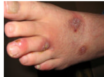
Lesions on foot