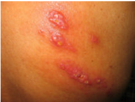
Lesions on back